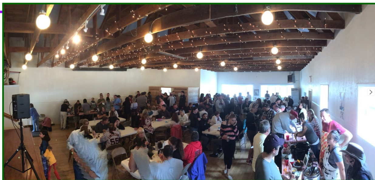
Chili and Chowder Cook-Off Packed the Firehouse, Photo by Breck Hitz

* We regret that The Surf Spot entries were not eligible for judging but appreciate their participation.