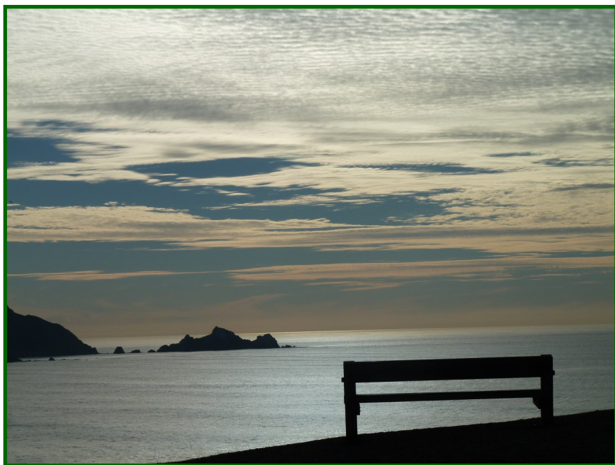
Ocean View