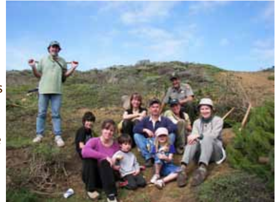
February Volunteers celebrate after a job well done