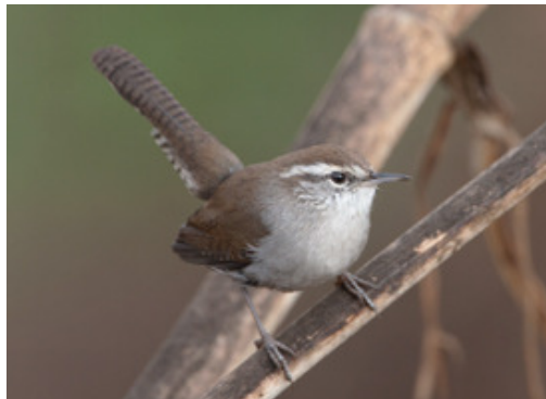
Bewick's Wren, a bird characteristic of the coastal scrub on the Pedro Point Headlands

www.pedropointheadlands.org . This hike is brought to you by the Pacifica Land Trust, supported by the California Coastal Conservancy and the Pedro Point Community Association