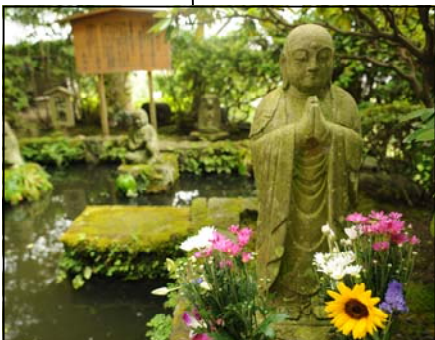
Zen Garden/Meditation ctr.