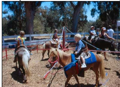
Party-Play place/Pony Rides