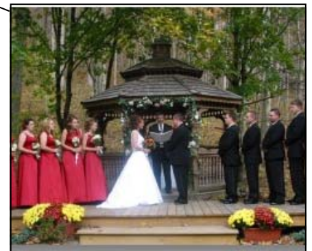
Outdoor Event Space